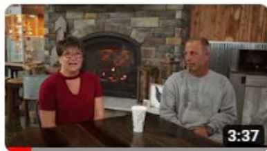
From the Land of Kansas - The State Trademark...