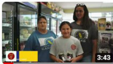
Meet Kansas Businesses